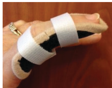
Example of a resting orthosis for osteoarthritis in the index finger

A hand therapist is a great resource in the treatment of hand osteoarthritis. The main goal in hand therapy is to decrease pain and improve hand function. A hand therapist may suggest using heat to decrease joint stiffness and pain. An orthosis may be used to provide rest and proper positioning to painful joints. A hand therapist will provide instruction in the use of adaptive equipment and also provide a specialized home program to protect the joints, decrease joint stiffness and improve the ability to use the hand.