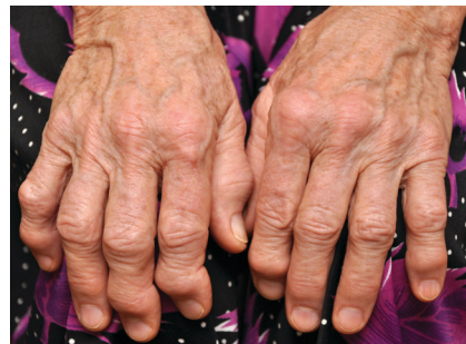
Bumps on the fingers that may develop due to osteoarthritis

cartilage between bones becomes thin or worn out. This allows the bones to touch and not move smoothly against one another. Arthritis in the hand may lead to pain, stiffness and loss of function.