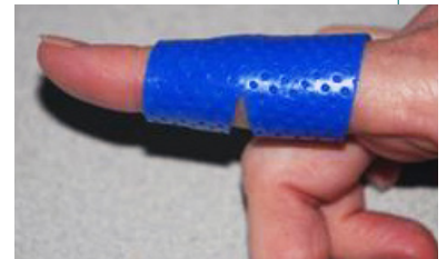
Example of custom finger orthosis for boutonniere deformity

To locate a hand therapist in your area, visit the American Society of Hand Therapists at www.asht.org or call 856-380-6856.