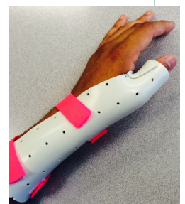
Examples of custom-fabricated orthosis for DeQuervain tendinopathy