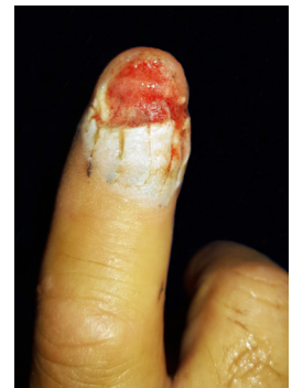
A fingertip injury showing damage to the nail

Fingertip injuries can cause bleeding, bruising and swelling. There may also be decreased feeling and a change to the shape of the finger. Some fingertip injuries may develop an infection. Due to nerve endings on the tip of the finger, these injuries may be painful and sensitive when touched.