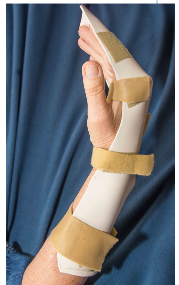
Example of flexor tendon orthosis to protect the injured finger

To locate a hand therapist in your area, visit the American Society of Hand Therapists at www.asht.org or call 856-380-6856.