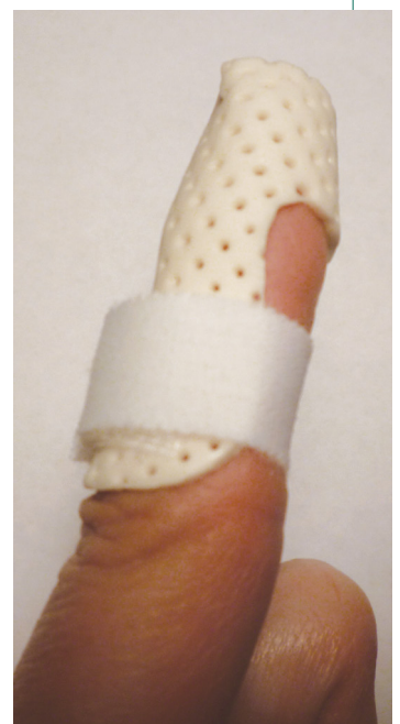
Example of a mallet finger orthosis

A hand therapist can make a cast or custom orthosis to hold the tip of the finger in the correct position to heal properly. Instructions can be provided on how to keep the fingertip perfectly straight while washing and doing other activities. When it is time for the tip joint to move, the hand therapist will help slowly reduce time wearing the orthosis and increase motion to prevent the tip from drooping again. The hand therapist will make sure all the joints of the injured finger are moving well.